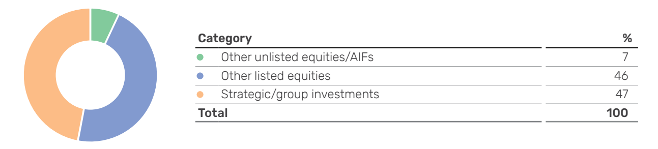
Chart B: Composition of equity investments (at cost)

BHIL's other equities portfolio has a track record of outperforming the Sensex over multi-year horizons (3/5/10 years) by 3 to 5% p.a.