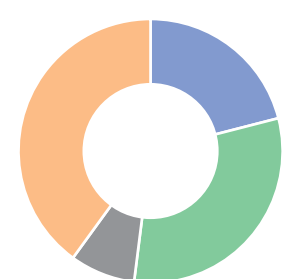
Chart C: Composition of debt investments (at cost)

Break-up of fixed income investments is presented in Chart C given below: